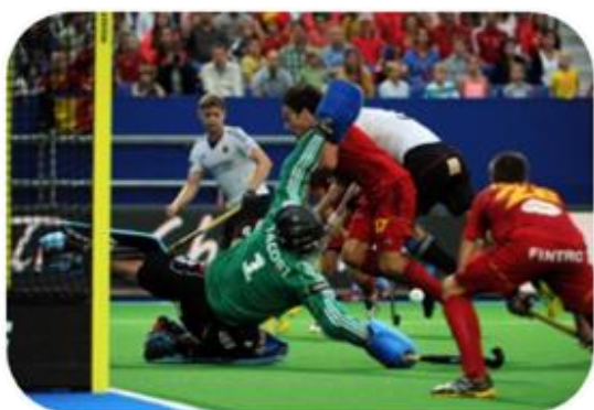
Breda Push workshop U18/U16 in August