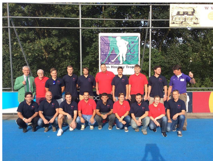
C4E Group in Breda 2014

The C4E targets talented young coaches from Europe and provides a programme of events running over a two year period. The programme is planned by the EHF Coaching group who organise workshops and webinars for the C4E group